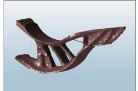
Inspire generated ideal shape for the part