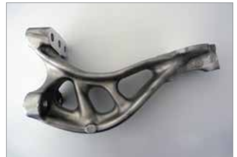
Final part forged by LEIBER