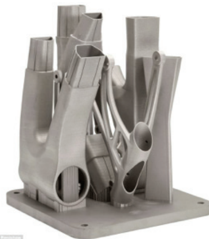
Bike frame components manufactured using additive manufacturing