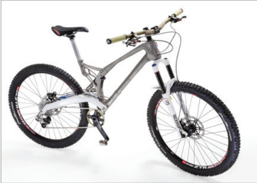
Final manufactured bicycle including seat post designed using solidThinking Inspire

The new material layout generated by Inspire provided a concept that not only met the performance targets but weighed less than the original.